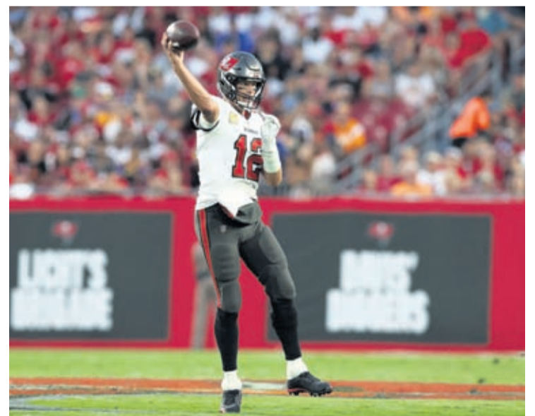
Tampa Bay Buccaneers quarterback Tom Brady (12) throws a pass during the first half of an NFL football game between the Los Angeles Rams and Tampa Bay Buccaneers, Sunday, Nov. 6, 2022, in Tampa, Fla.

the guys that I've played with, who have blocked for me, have caught passes. ... I can't do (anything) in this league without guys doing what they're amazing at, too," Brady said last Thursday. "They're great achievements," he added. "But as much as people want to say: 'Oh, this is what Tom Brady did.' In my mind, this is what myself and all these other people that have contributed to my life have done as well." □